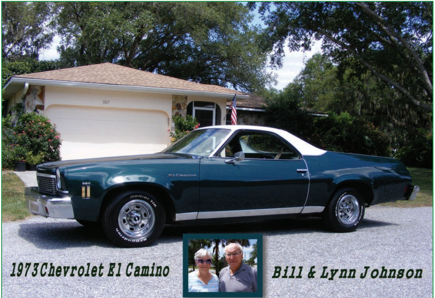
1973 Chevrolet El Camino